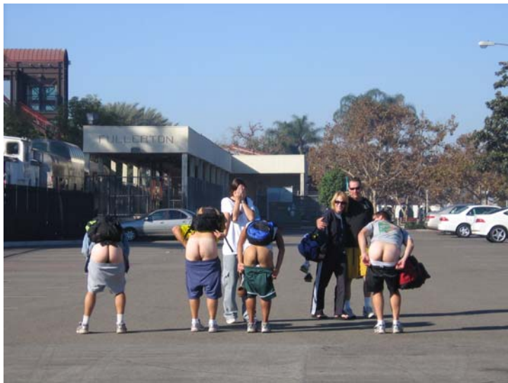
The Humpin' Hash has arrived...