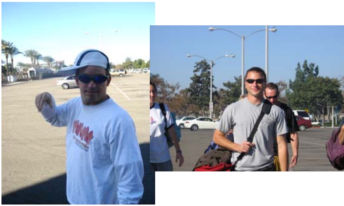
The Rum Bar is open!