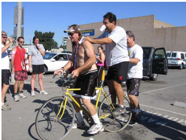
SuperScar and Bust'er Share a ride on the Crack inspired Hash Shit