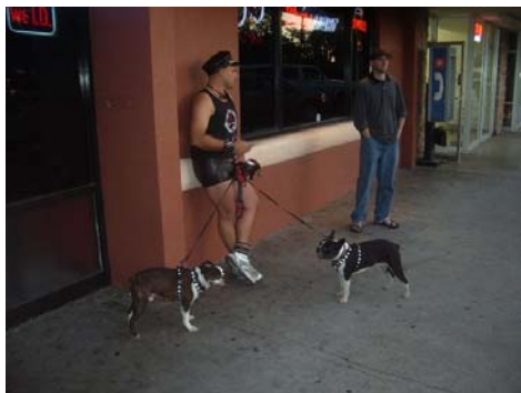
Lance A Nut ...what have you been up to?