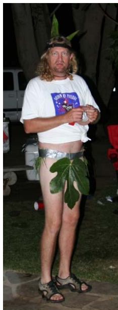
...we don't want to know Whaleboner...