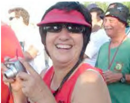
Geezer Teaser gets ready to flash!

The Inquiring Reporter attended the Signal Hill Hash on Monday night, and asked some hashers the following question: "What did you think of last Thursday night's trail?"