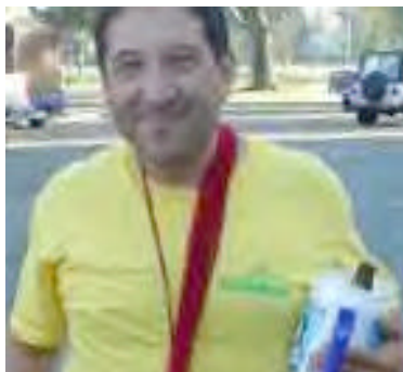
Buster gets ready for his big solo.

A SPECIAL EDITION OF THE SNOOZE WILL FEATURE ALL THE PHOTOS AND WRITE-UPS FOR THE 3 GREAT TRAILS – and GREAT PARTYING AND FEASTING THAT 100 HASHERS ENJOYED AT INDIAN HILL CAMPGROUND IN TEHASHAPI. LOOK FOR THE SPECIAL SNOOZE CUMMING SOON !