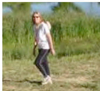
A sneak preview of LBH3's campout Snooze review.

THANKS TO THE CAMPOUT COMMITTEE FOR A GREAT WEEKEND. GOOD JOB!!!!