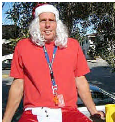
Santa shows off his Christmas package.