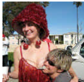
Spread 'Em spreads some good Christmas cheer!