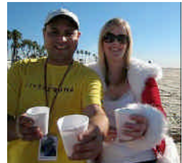
We've got some Christmas cheer in these cups too!

White Elephant brought just Taegen , who, at fourteen is as hormonal as you might expect. Easy Sleazy Lush brought Wenge , named after an African hard wood, gotta wonder, 'eh?