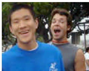
Hey – save some turkey for me!

So the hares were off and the pack began the hunt after the appropriate head start. We headed out of the lot down the back alley paralleling 2 nd street. Luckily Officer Asshole did not appear to be out this morning so no one ended up with jaywalking tickets. Trail continued down the alleys for a couple blocks and then headed up to second where we