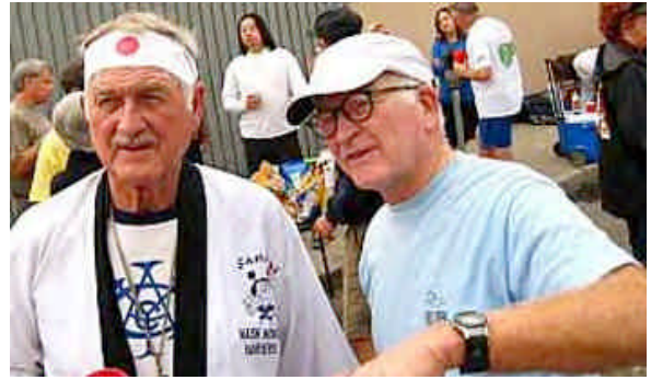
Commander, I think our invasion of Little Tokyo went rather well.