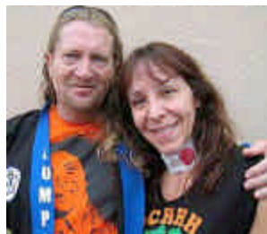
That was fun. Let's do it again next week.

You look just like the guy on the t-shirt. Imagine that!