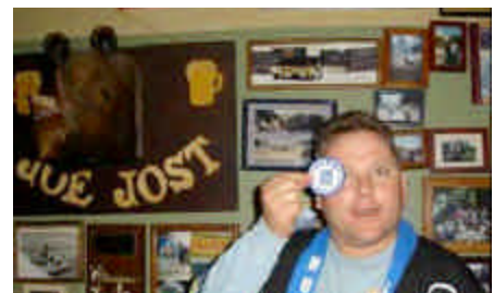
You do 25 runs and what do you get?