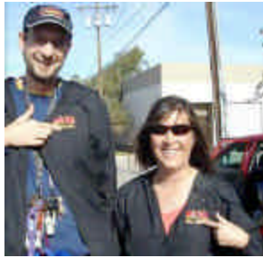
NippleSchnitzel cums for a visit.