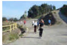
Season's Greetings from Signal Hill, a picture postcard day!