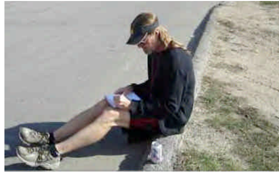
Superscar (and ever-present PBR) record accurate details of the events of the day. Of course it's all true ....

pit are dope heads, gangs of homeless psychopunks and hashers that plummet down the side of the mountain like drunken Kamikazes. We quickly dropped into the hellhole and wee soon up the other side and into a quiet neighborhood and back across Cherry Avenue. The trail then led us past the Signal Hill Police Station. I could see that nobody was there because all of the rich people on the hill had them out chasing hashers. I was fresh out of LBH3 business cards, so I left an empty PBR can and 5 pounds of mud and shit that I'd scraped off of my shoes on their doorstep to let them know we'd stopped by.