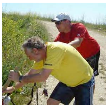
The scribe and the Birthday Boy.

Come on guys, leave the rattle-snake alone.