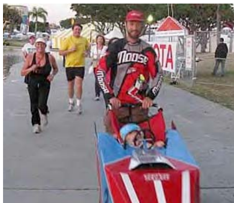
Just John has the fastest stroller in town.

However, the savage beast was soothed when the trail ran us through the middle of the night's entertainment --- 4 hot hot hoooooootttttttt motorcyclists doing twisty turny sexy hot stunts on their motorcycles in the air above the crowd. As the harriettes enjoyed the rewards, hands reverently placed in pants, Last Train sauntered up and commented, "You know what I would have liked better? A topless show!" All the excited females agreed quickly --- we want to see those hot motorcycling men naked just as much as Last Train does. Girls asked Howdy Doo Me on the road for photo ops. He agreed, but since he was FRB there's only a swoosh across the photos.