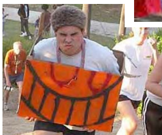
Looks like Ben Dover has plenty of gas!