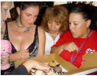
Check out those cupcakes!