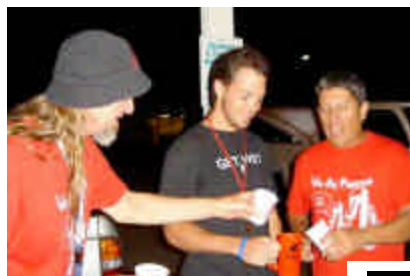
Here's to the newly named Chinball Wizard.