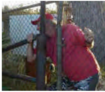
For 10 points, what the heck is he doing?