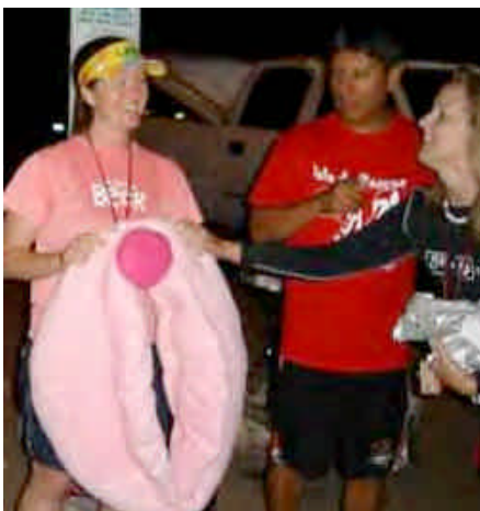
Do you think that this will lure Big Pink back? It sure smells like bait!

On Friday morning I woke up and I thought, I am going to have a fucking awesome life with hashing, beer, and bitchin' parents!